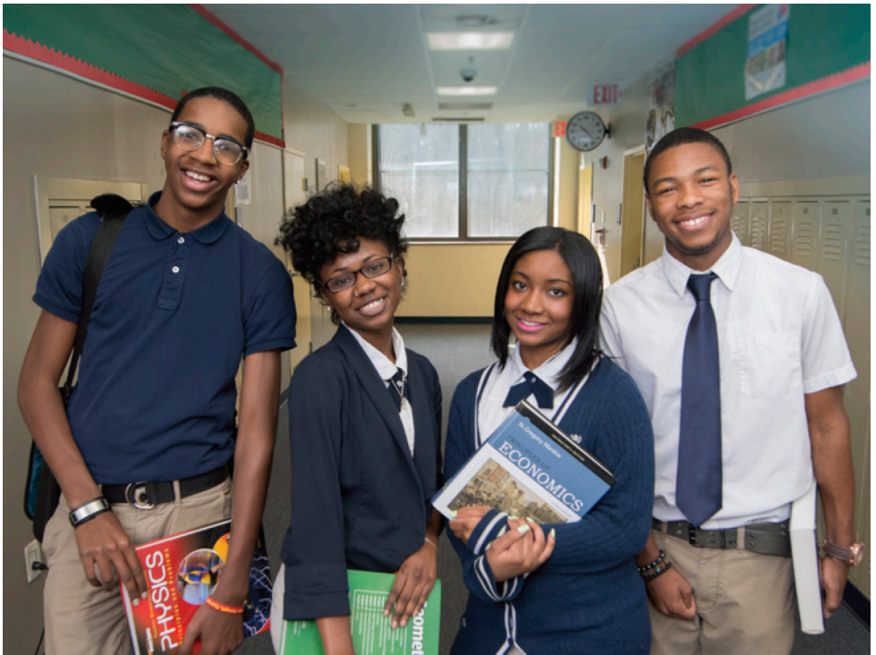
Friendship PCS / Courtesy of Friendship PCS