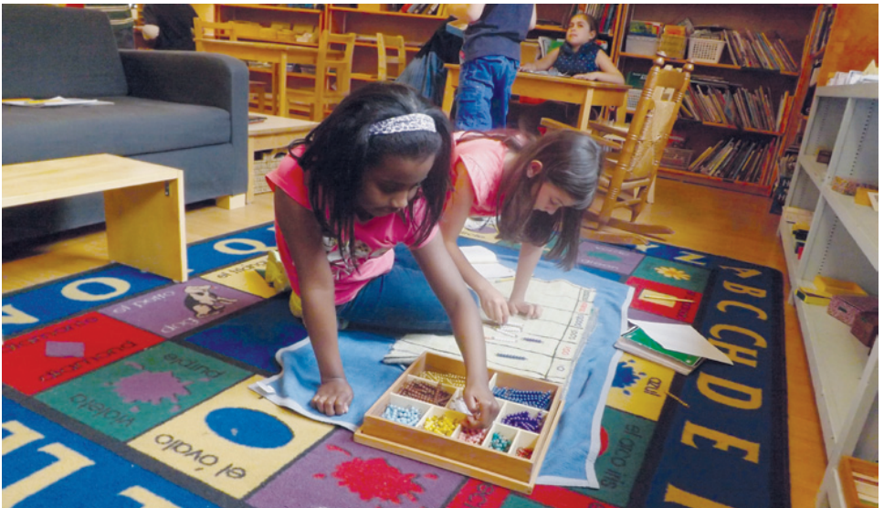
Students at Latin American Montessori Bilingual (LAMB) PCS