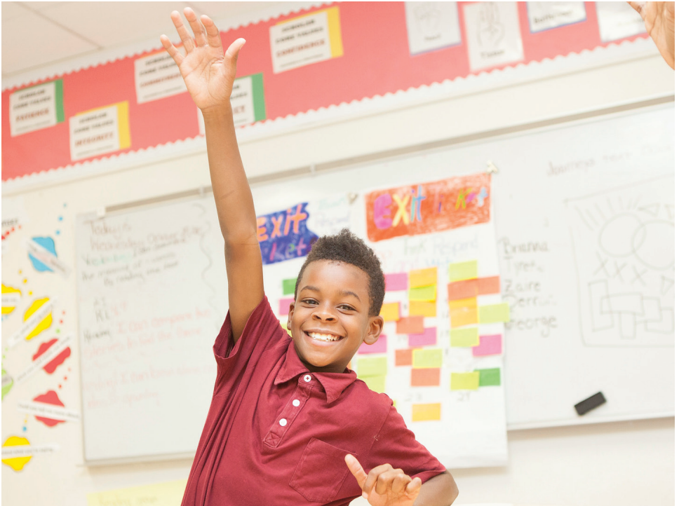
Friendship PCS - Technology Preparatory Middle School Academy