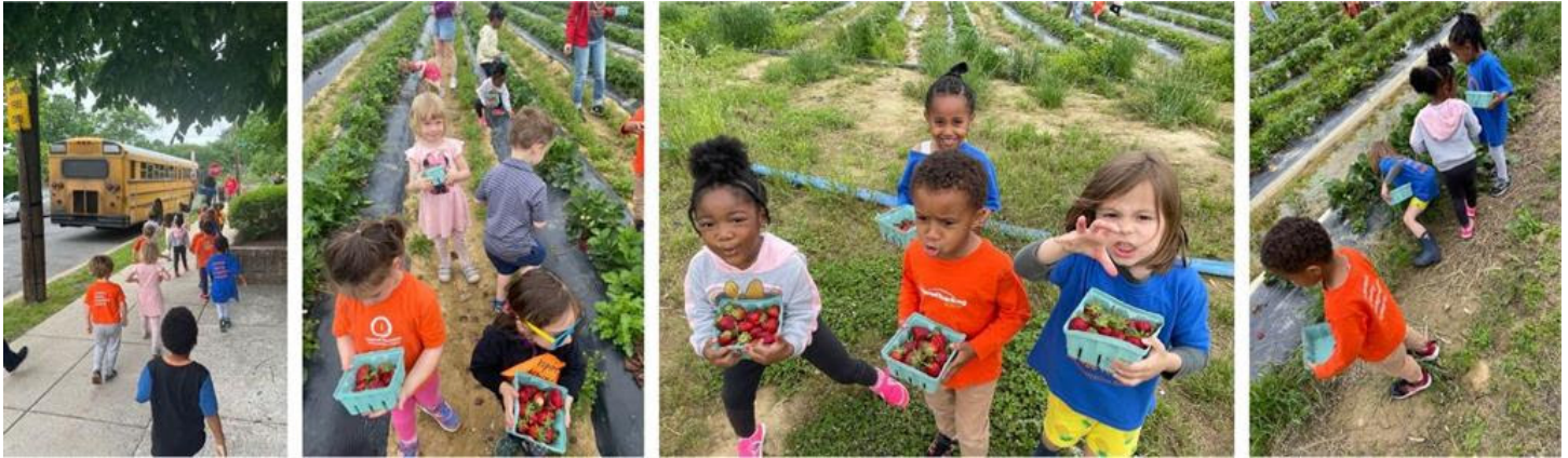
It's field trip season at ITDS! Here, PK3 is picking strawberries at Miller's Farm.